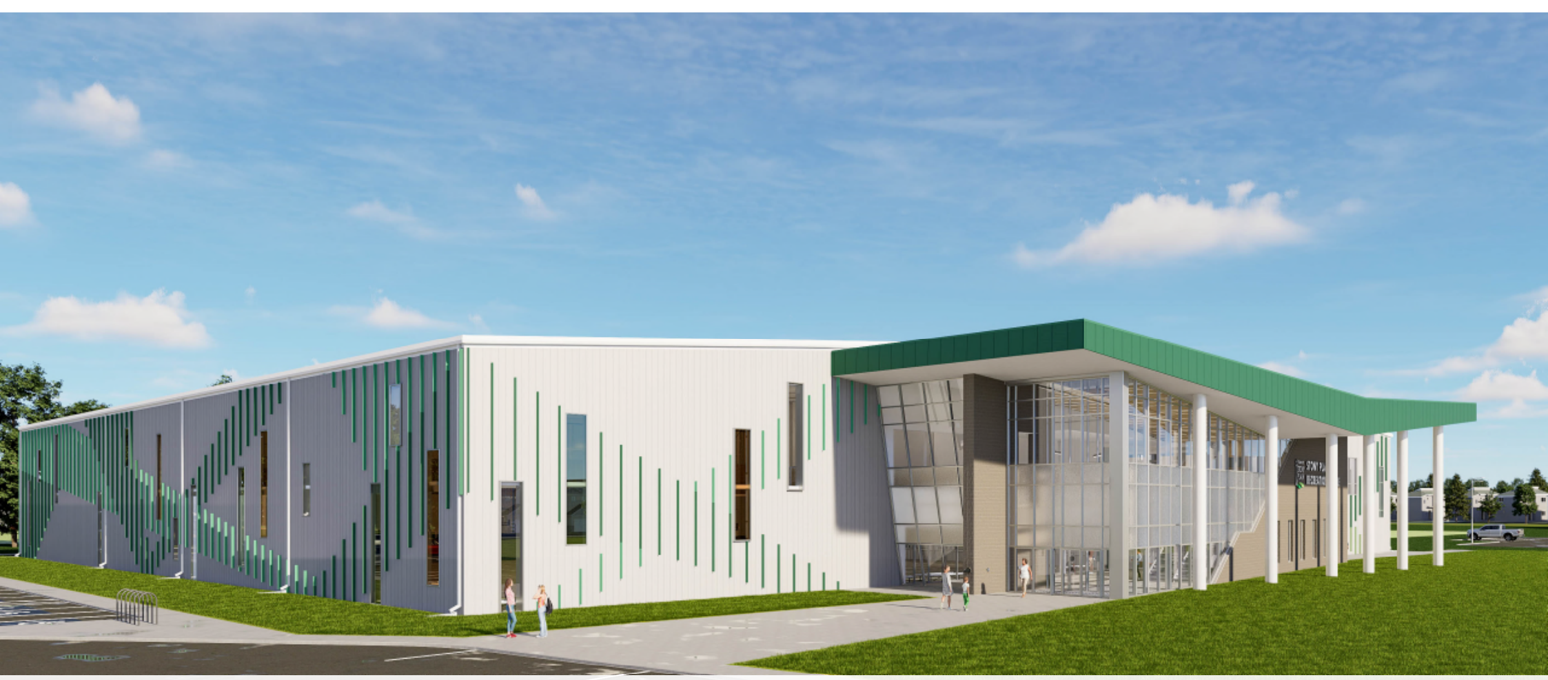
Stony Plain Recreation Facility