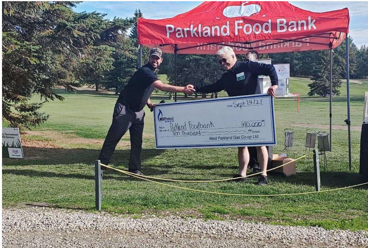
West Parkland Gas Co-op Ltd. raised $10,000.00 for the Parkland Food Bank with the 2021/22 "Support Local" Tri-Region Coupon Book Fundraiser