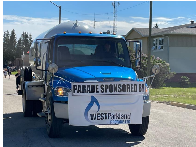
West Parkland Propane recently sponsored the 2022 Heritage Days Parade