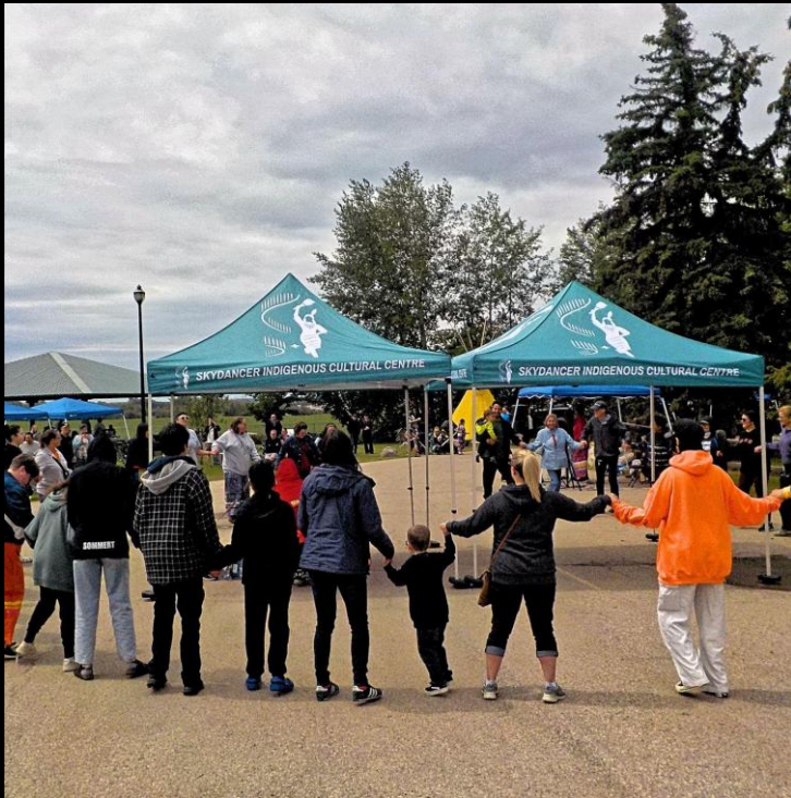
National Indigenous Day June 21