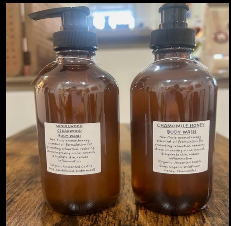
Skin care and Herbal Tea