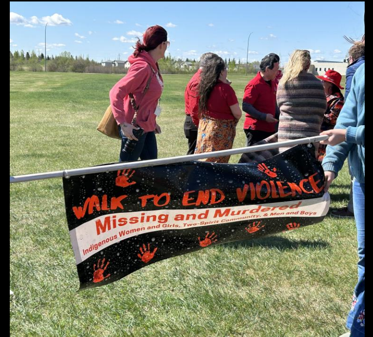
Missing and Murdered Indigenous Peoples Walk – May 5