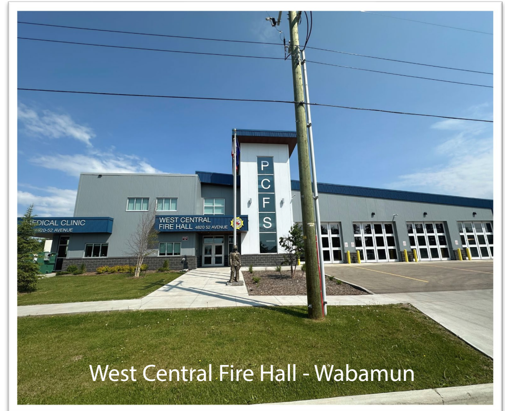
West Central Fire Hall - Wabamun