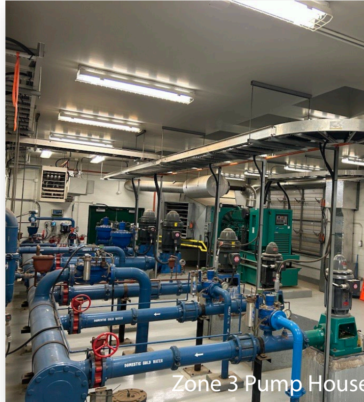
Zone 3 Pump House

provides direct utility services to County residents through the operation and maintenance of potable water distribution systems, wastewater collection systems, and wastewater treatment systems.