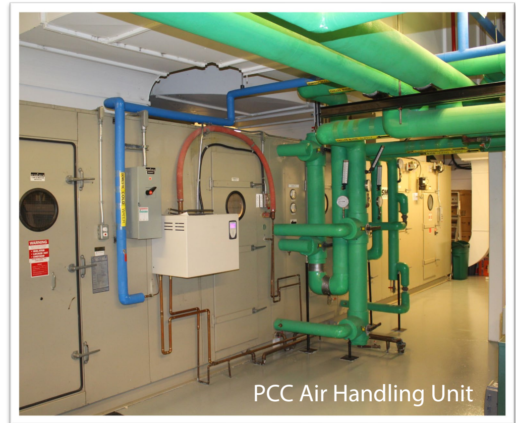
PCC Air Handling Unit