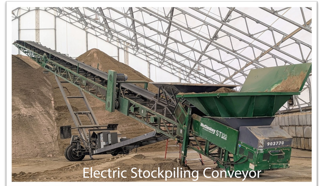
Electric Stockpiling Conveyor