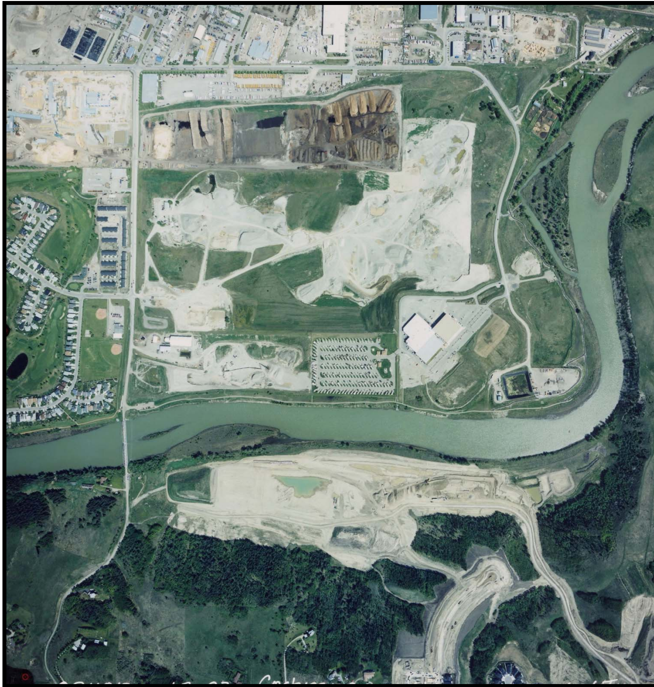
2011 Air photo of the BURNCO Cochrane Pit AB.