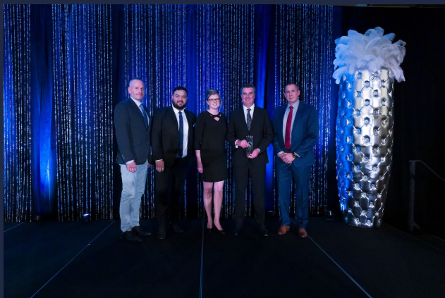
Zender Ford Association Member of the Year