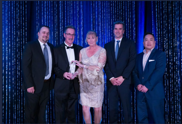
Jen Col Construction Medium Business of the Year