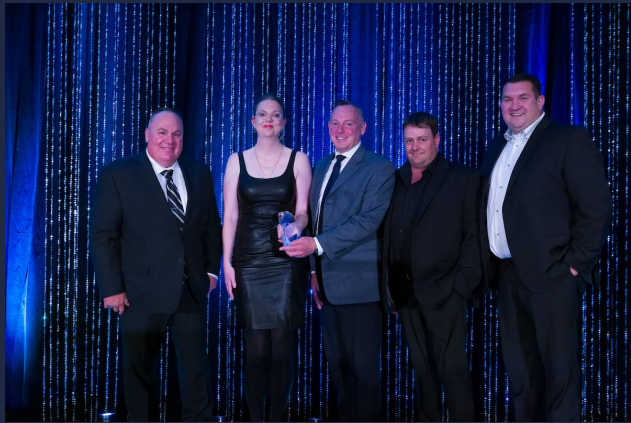
NCSG Crane & Heavy Haul Large Business of the Year