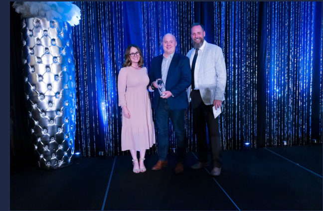
JAPA Machinery Group Small Business of the Year