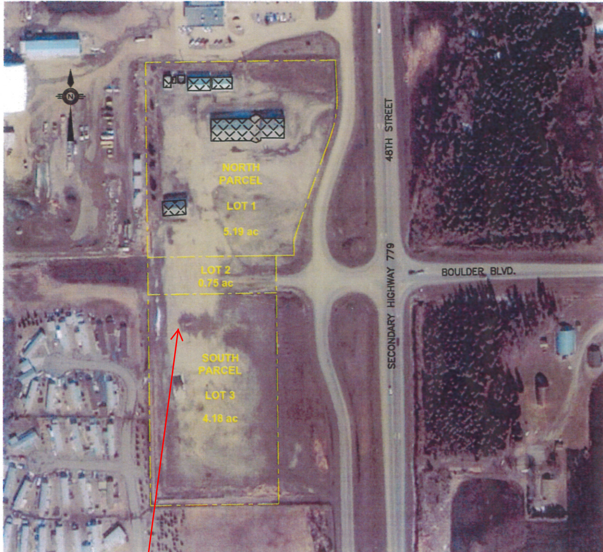
HIGHWAY MAINTENANCE YARD STONY PLAIN

EMS Station located north end of this site.