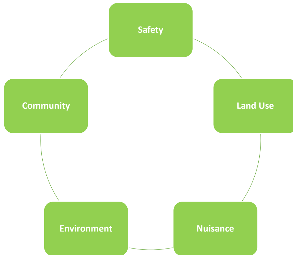
Figure 2: Themes from the public engagement

The amendment to the definition of Outdoor Participant Recreation Services is a contentious issue. Over 100 attendees were recorded at the Open House on June 15 th , 2017, and 21 individuals spoke at the Council meeting on July 11 th , 2017. The common themes to the input were: safety, land use compatibility, nuisance, environmental concerns, and community values.