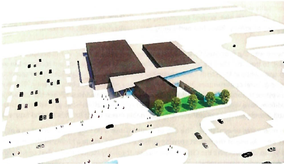
Figure 1: Proposed Civic Centre aerial rendering

It should be emphasized again that the additional community amenities are meant to improve access to programs and services for the community vs. being included to improve the operating performance of a stand-alone spectator arena. Ultimately, the Civic Centre would address critical ice shortages in response to a rapidly growing community, while also making a significant improvement in addressing library space needs and other cultural spaces investments.