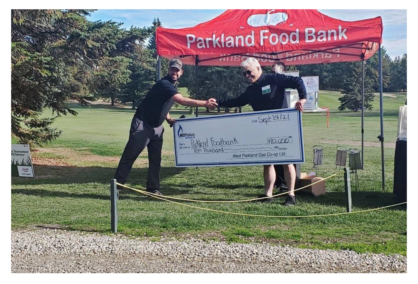
West Parkland Gas Co-op Ltd. raised $10,000.00 for the Parkland Food Bank with the 2021/22 "Support Local" Tri-Region Coupon Book Fundraiser