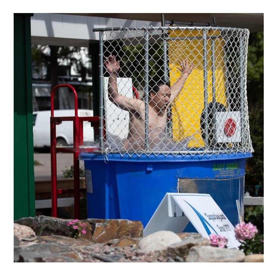
The 2021 Summer Dunk Deep-Freeze raffle for a chance to dunk the Mayor of Stony Plain raised $6,000.00 for the Coordinated Suicide Prevention Program