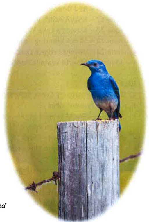
Little Boy Blue—Beaverhill subwatershed