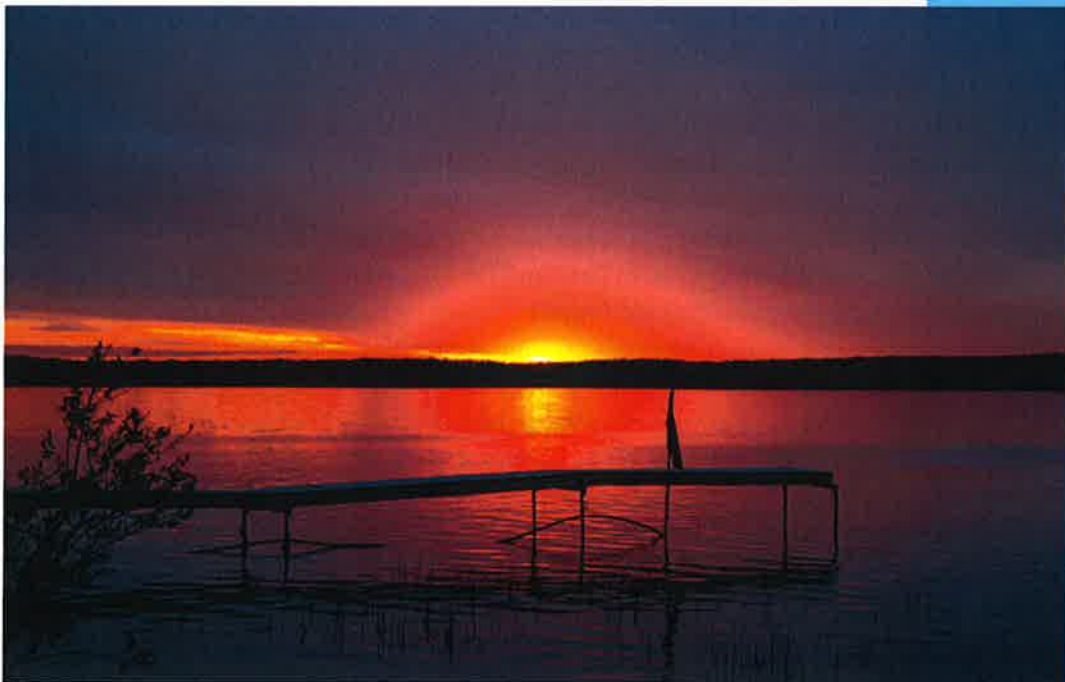
Wabamun Lake

The NSWA specifically promoted the development of Municipal Watershed Partnerships during 2015-16 to address key watershed issues. The partnerships include the Vermilion River Watershed Alliance, the Sturgeon River Watershed Alliance and the Headwaters Alliance. All municipal partnerships are supported by elected officials and staff, and provide the local leadership necessary to guide IWMP implementation. The NSWA is providing technical and administrative secretariat support to each municipal partnership.