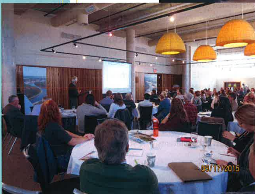
Sturgeon River Watershed Forum September 2015