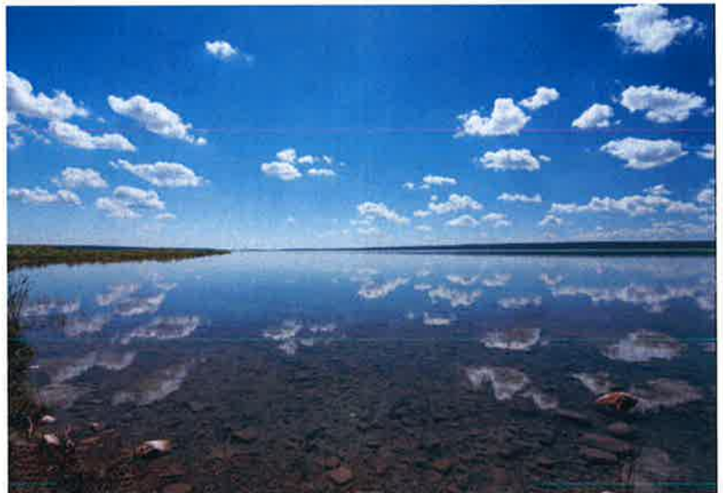
Frog Lake