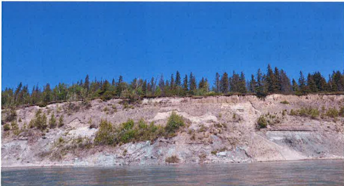
North Saskatchewan River.

The NSWA also appreciates the generous support of our many other municipal, industrial and organizational sponsors.