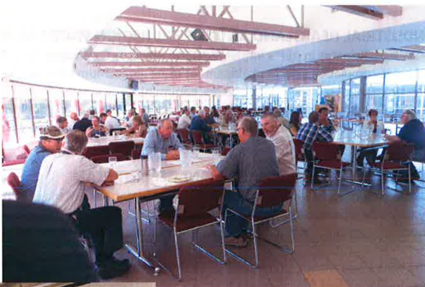
Participants at the Vermilion River Watershed Forum -August 2015

On September 17, 2015, the Sturgeon River Watershed Forum was held at the Enjoy Center in St. Albert. There were 78 participants who heard presentations on a variety of topics including invasive species, long term trends in prairie climate and water supply, and agricultural issues in the watershed.