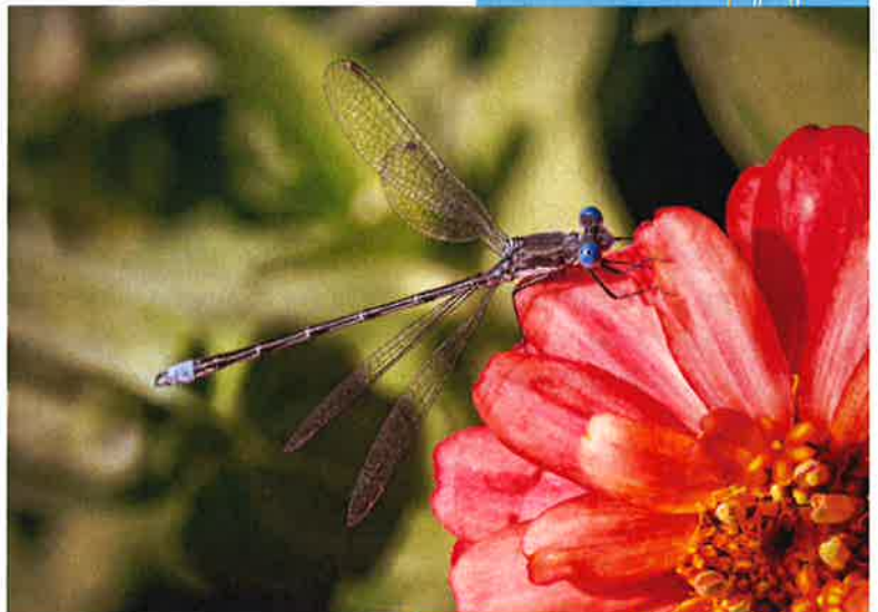
Spreadwing on Flower

The Alberta Water Council regularly reviews the progress of “Water for Life” and then recommends to the Government of Alberta how implementation could be enhanced. NSWA has been actively involved in the work of the Review Committee as the representative of the WPAC Sector.