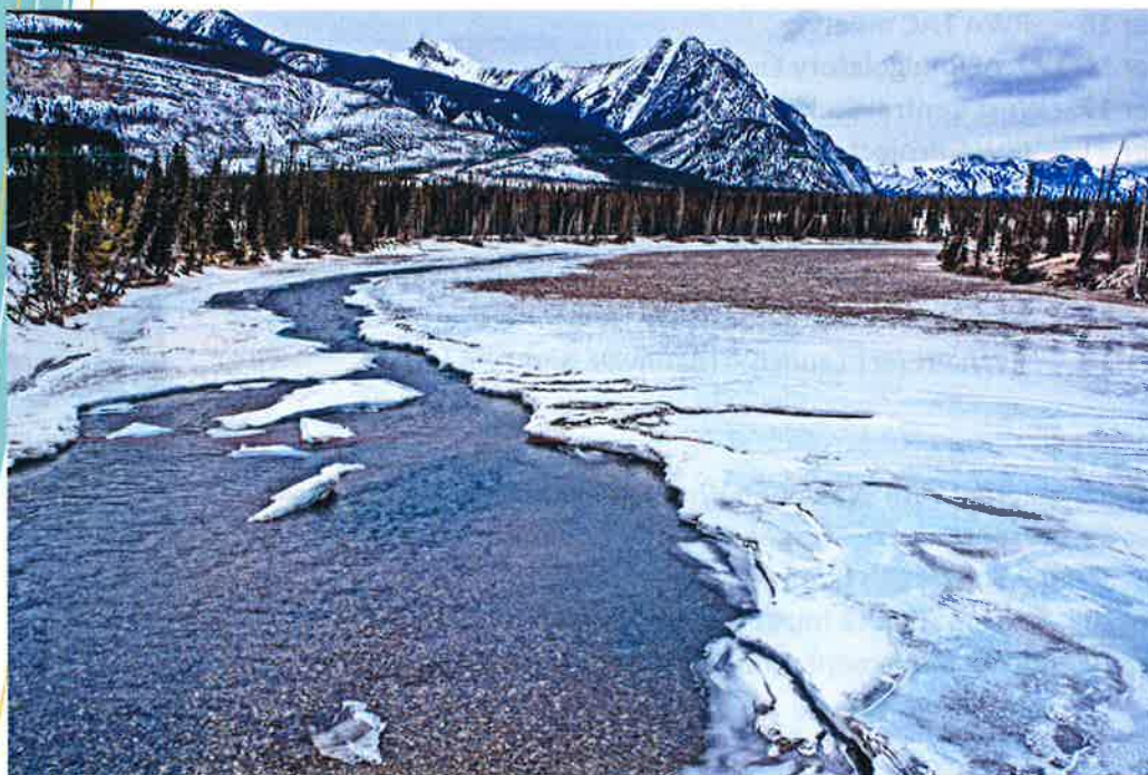
Cline subwatershed—North Saskatchewan River a few hundred meters before it enters Abraham Lake near Preacher Point.