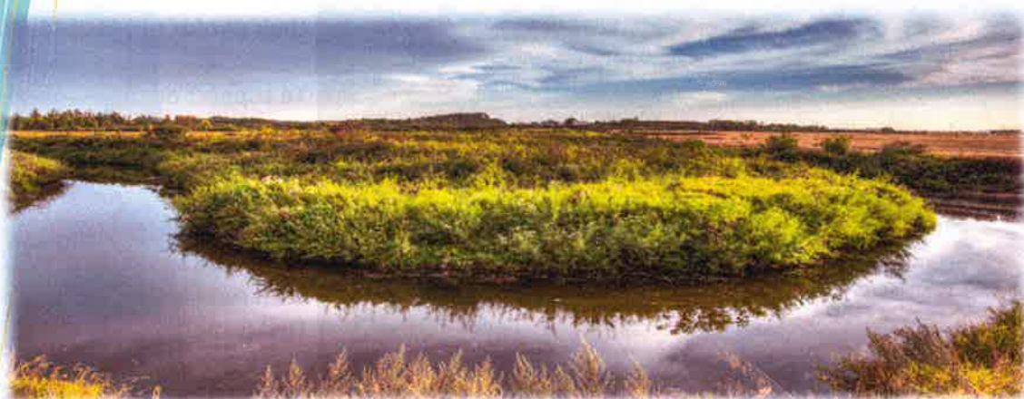
Vermilion River.

The NSWA is responsible for assessing and reporting on the state of aquatic ecosystems in the NSR watershed. In September 2015, CPP Environmental was contracted to complete an aquatic survey of seven reaches of the Vermilion River. This survey characterized the state of this ecosystem through examination of habitat quality, aquatic vegetation, macroinvertebrates, and fish. A report on the ecosystem assessment was finalized in the spring of 2016.