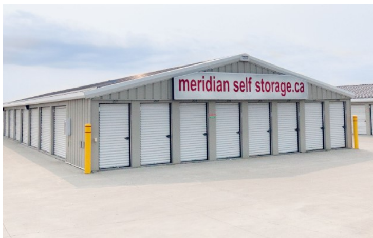
Meridian Storage, Stony Plain, Source: https://meridianselfstorage.ca/