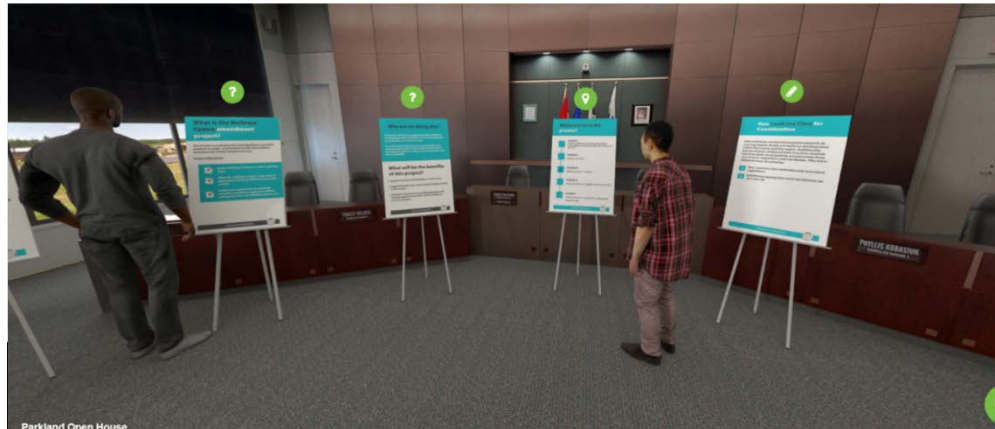
Virtual open house by ISL Engineering for Wellness Centres LUB amendment