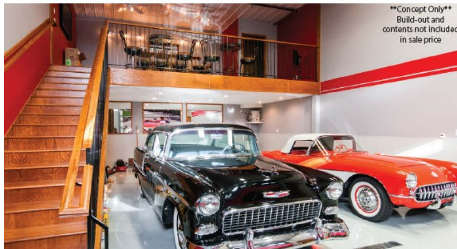
Boys' Toys Storage, Edmonton., Source: https://www.boystoysedm.ca/