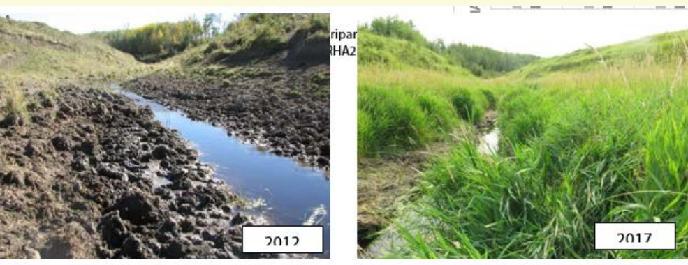
Figure 3. These two photos show a major improvement in vegetation cover along the stream banks from 2012 to 2017.